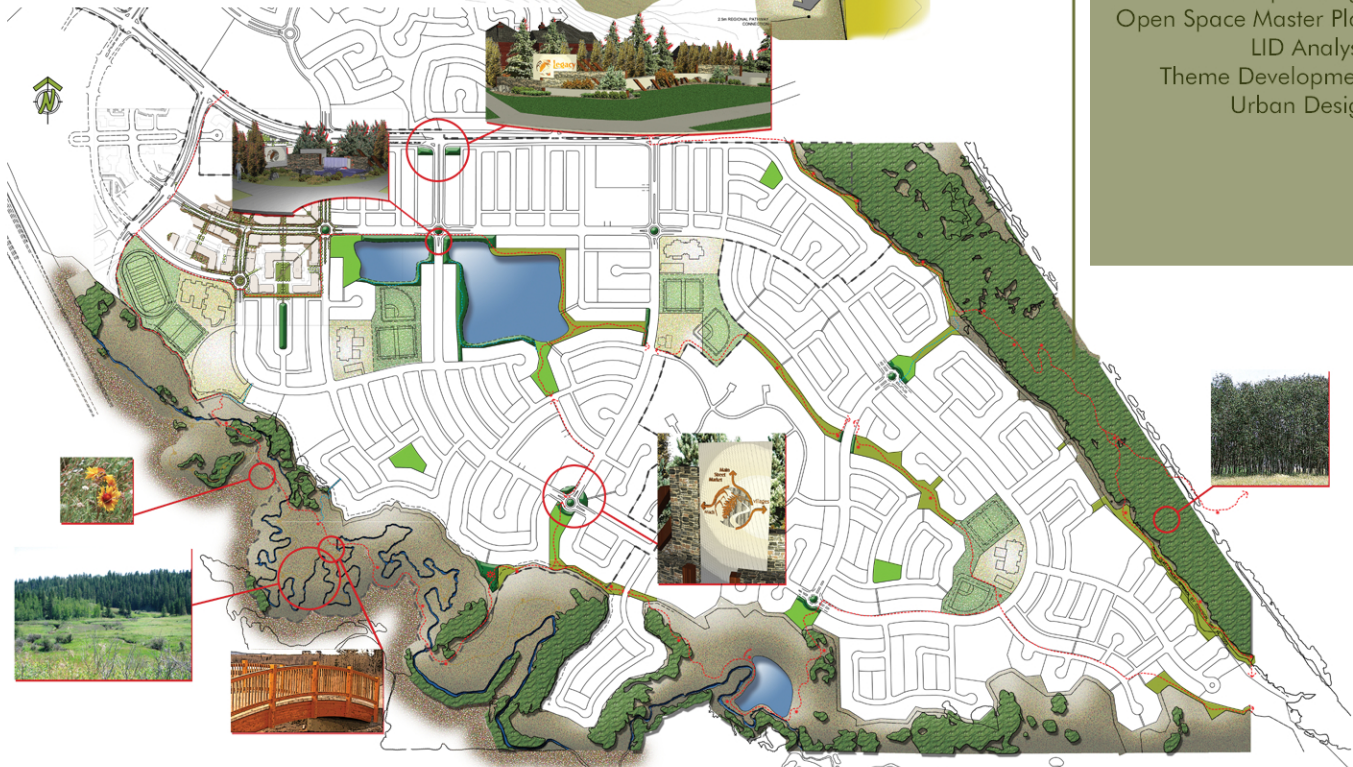
Open Space Plan This plan is conceptual only and may be subject to change